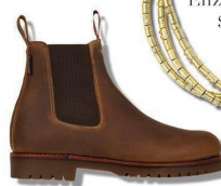
Boots by Penelope Chilvers, $350