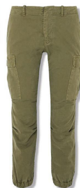
Trousers by Nili Lotan, $375, at Net-A-Porter.com

Scan & Shop safari-style pieces with the NET-A-PORTER APP