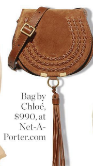
Bag by Chloé, $990, at Net-A-Porter.com