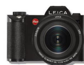
Camera by Leica, from $5,995