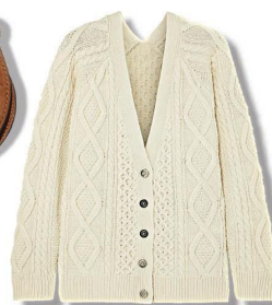
Cardigan by 3.1 Phillip Lim, $595, at Net-A-Porter.com